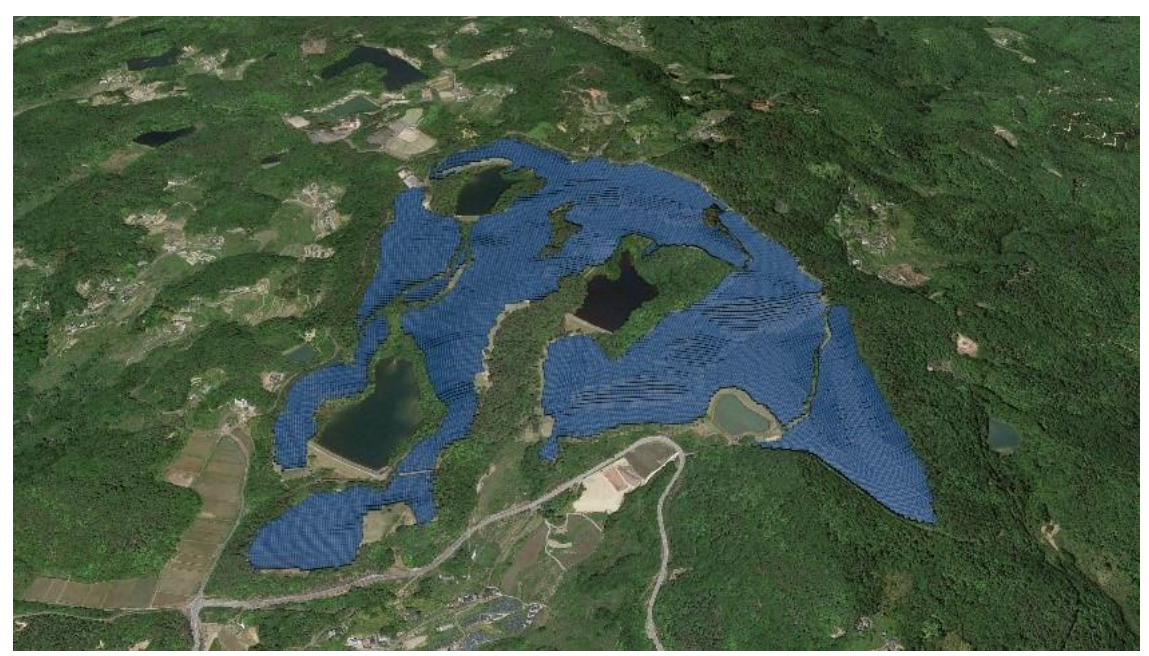
Bizen Mega Solar Power Plant Completion Image